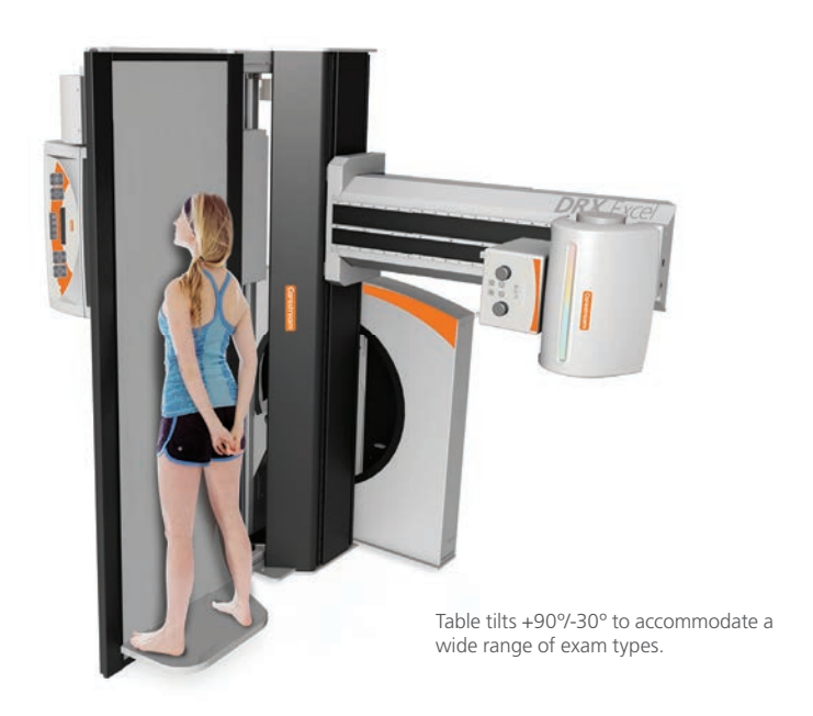
Image-stitching station combines multiple images into one for easier reading of spine and lower-limb exams.

Four-way table movement facilitates easier patient positioning.